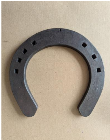
14" 1 x 3/8 Front Plain stamped shoe hammer finish