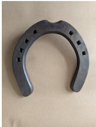
16" 1 1/4 x 1/2 Suffolk Bevel Hind Rasping allowed

The forges being used are either Hand Crank or bellowed