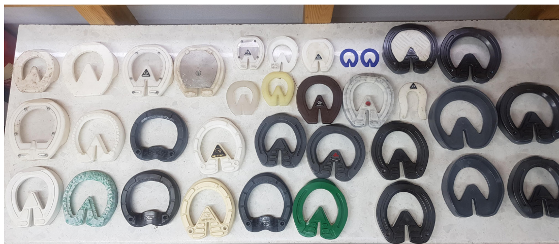
Left: Imprint development shoes and accessories